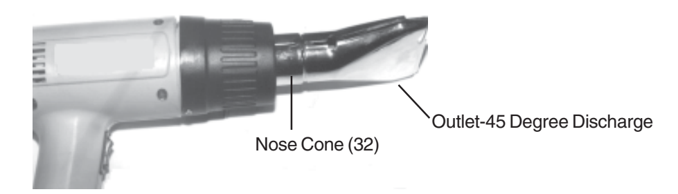
Figure D-Nose Cone with Attachment

Step 1) Make certain to cover all surfaces that should not be heated with nonflammable material.